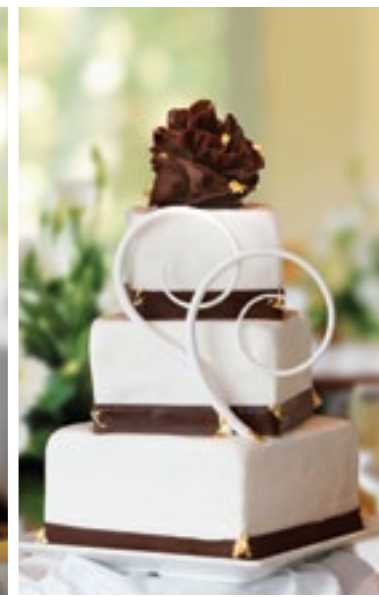
SIMPLE & SWEET